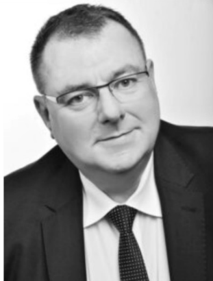
Ingo Bodtke MdB

Der Beirat der Allianz der Verbände e.V.