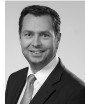
Stefan Mayer MdB