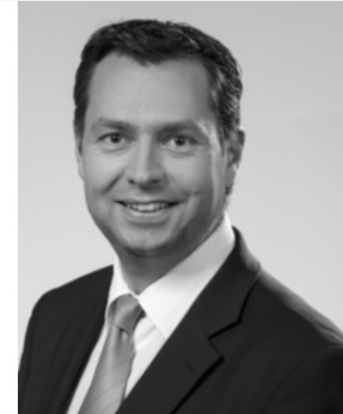
Stefan Mayer MdB